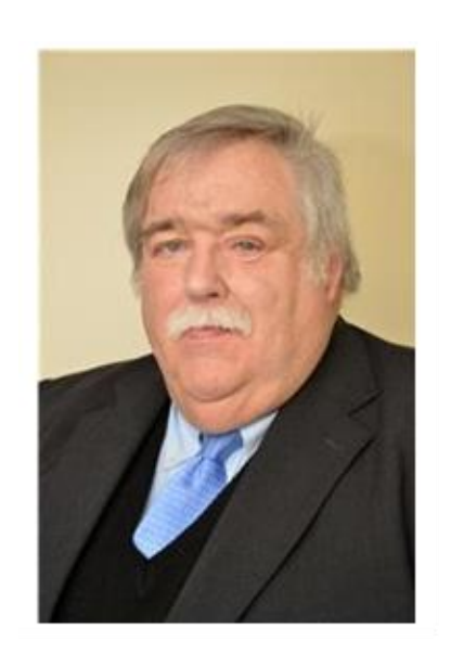
Chair: Shepton LCN